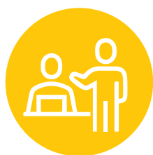
Simulations in Gamification Mode