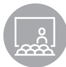
Bespoke Training Programs